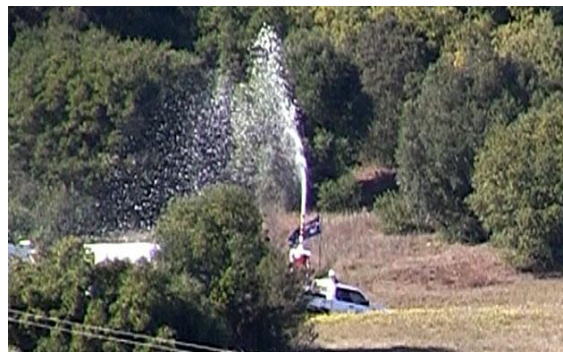
AGL's gas well 'incident' at Menangle May 2011

The Camden Gas Project , operated first by Sydney Gas and then AGL, has been producing gas on Sydney's urban fringe for 11 years...but did you know...?