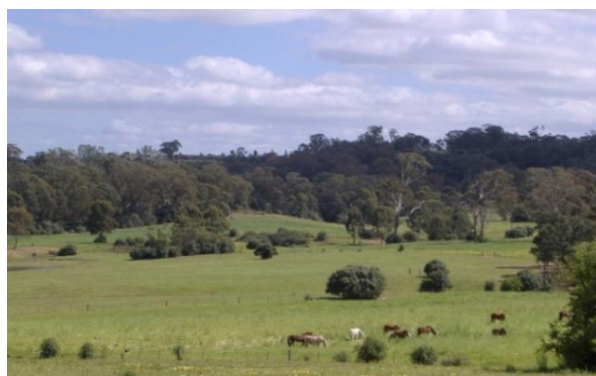
The Scenic Hills Today: horses, historic 1830's Charles Sturt dams and Carmelite Monastery.

AGL Energy Ltd (AGL) has applied to the NSW Minister for Planning (Project Application 09_0048) to put up to 66 coal seam gas (CSG) wells across Campbelltown's Scenic Hills from Denham Court in the North to Mount Annan in the South, and into Camden's newest suburbs...and this is just the beginning: storage tanks, lateral wells that run for up to 2.5 kms under the surrounding Sydney suburbs , well sites joined by pipelines and access roads for industrial rigs and trucks carrying contaminated waste water and chemicals leading into residential streets and roads. A gas treatment plant may still be built.